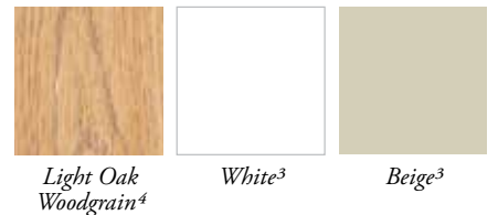
Light Oak Woodgrain 4