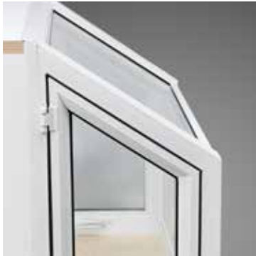
Sloped top insulated glass (a constant 35 degrees) is tempered for increased safety and structural integrity of the unit.