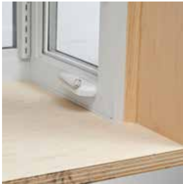
The head and seatboard are completely assembled for easy installation.