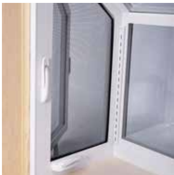
Fully screened, twin-sealing operating casements with exterior glazing increase protection from inclement weather and allow convenient venting for fresh air.